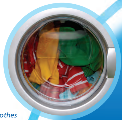
Helps keep clothes from discoloring

A prevailing home water challenge is preventing corrosive water and reducing leaching of unhealthy contaminants that seep from your plumbing into your water. If you see staining on your fixtures or other appliances, you know you have a water quality problem. Our water filtration systems can treat a variety of common household water conditions, including iron, chlorine, turbidity and low pH. If left untreated, these factors can cause unpleasant water taste and smell, and conditions unfavorable to your family's health. What's more, over time costly issues will develop, such as discolored clothes, tub and toilet stains, sediment build-up, corrosion and deterioration of your plumbing and reduced longevity of water-using appliances.