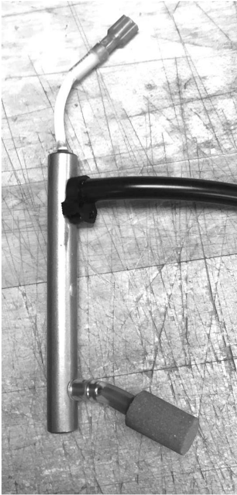
Corona Cell With Filter Stone