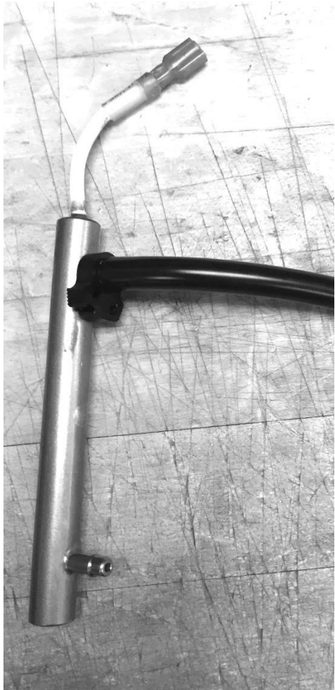
Corona Cell Without Filter Stone